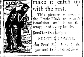
This picture represents the Trade Mark of Scott's Emulsion and is on the wrapper of every bottle. Send for free sample. SCOTT & BOWNE, 109 Pearl St., New York. 50c and $1.00 bottles.

Scott's Emulsion can stop that blight. There is no reason why such a child should stay small. Scott's Emulsion is a medicine with lots of strength in it—the kind of strength that makes things grow. Scott's Emulsion makes children grow, makes them eat, makes them sleep, makes them play. Give the weak child a chance. Scott's Emulsion will make it catch up with the rest.